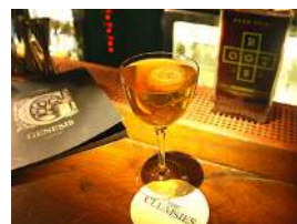
THE CLUMSIES, ATHENS