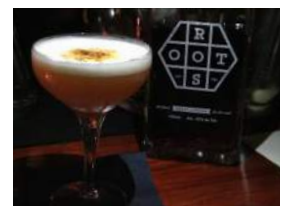
ANGEL'S SHARE, NEW YORK

ROOTS SERVES THE WORLD'S BEST AROUND SOME OF THE BARS