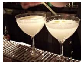
THE AVIARY, NEW YORK