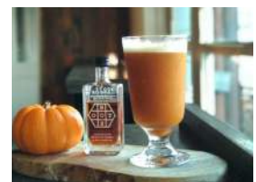
SAXON & PAROLE, NEW YORK