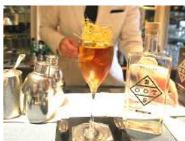
AMERICAN BAR AT THE SAVOY, LONDON

Roots Mastic Vintage Strength follows the old mastic recipe & tradition of stronger spirits, using even more mastic distillate than the normal edition, resulting to 40%ABV