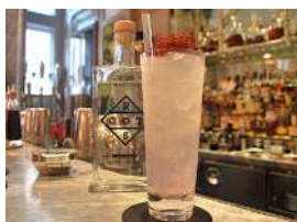
THE CONNAUGHT, LONDON

ROOTS SERVES THE WORLD'S BEST AROUND SOME OF THE BARS